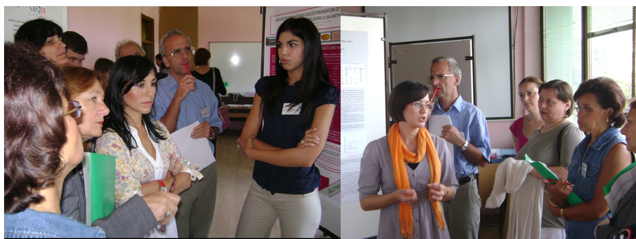
Young researchers presenting their posters to the Poster committee

Three posters of the early career stage researchers (up to 35 years) were awarded by the Poster Committee that judged the poster presentations according to the following criteria: organization/content/aim of the poster, visual impact of the poster, and quality of the answers provided.